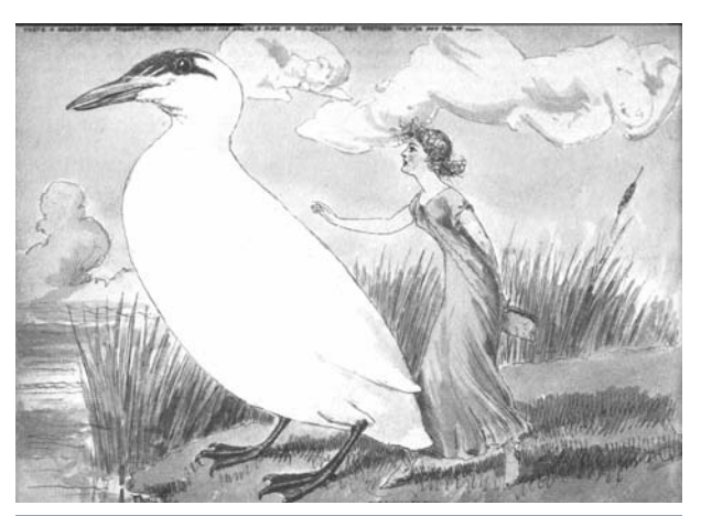
FIGURE 3 Giant bird and female figure.

The most substantial and widely-known body of Doyle's