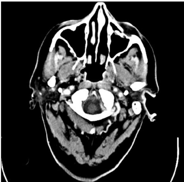
FIGURE 2 Follow-up CT scan seven months later. The cuff of tissue around the left carotid artery, internal jugular vein and soft tissue around the lateral pterygoid is less marked than previously.

In our case the symptoms of otalgia and discharge should have raised the suspicion of localised infection or malignancy, mandating otoscopy. Particularly important otoscopic features would include granulation in the bone–cartilage junction of the external auditory canal as one of the hallmarks of NOE. 5 Bell's palsy should be a diagnosis of exclusion and poor response to treatment should raise the possibility of misdiagnosis or an atypical infective pathology.