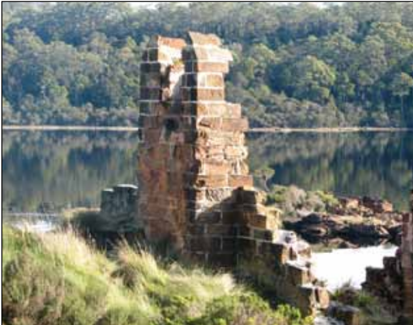
FIGURE 2 The ruins of the penitentiary on Sarah Island (image courtesy of Steve Johnson, Tasmania Parks and Wildlife Service).

The accident of the gun-shot wound did not therefore cause the death of George Walton, no vital parts having been injured, and the length of time elapsing from the injury until the commencement of the secondary fever, and which terminated by general erysipelatous inflammation, arising from a diseased liver and spleen. 26