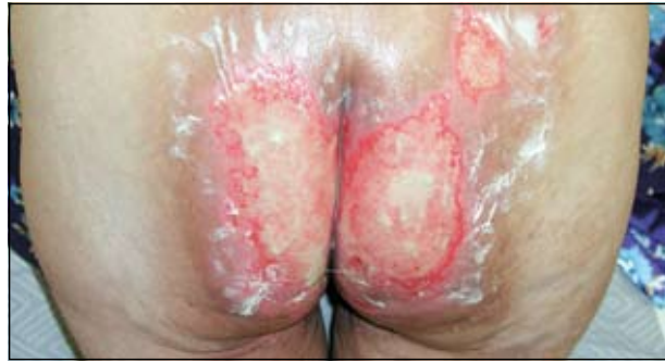
FIGURE 2 Low CD4+ lymphocyte count (<200/ \mu l) is known to increase radiation-induced skin toxicities, and skin desquamation as seen here is an indication for the discontinuation of radiotherapy. Otherwise, a skin graft repair will be required.

Despite this, some studies reported that a disruption of the radiotherapy course or an early stoppage of radiotherapy due to low CD4+ count did not affect the outcome of the treatment, suggesting a lower radiation dose may be sufficient in the presence of a low CD4+ lymphocyte count. However, Claude et al. 3 reported that a lymphocyte count of less than 0.7 \times 10^9/l was a poor prognostic factor for survival, compared with the level above that (hazard ratio 1.9), in patients receiving cranial radiotherapy for brain metastases from breast cancer.