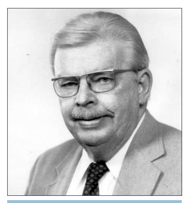
FIGURE 4 Professor Raymond Ahlquist (1914–1983), the American pharmacologist whose study of the actions of ephedrine led to important new discoveries on the classification of adrenoceptors into the alpha and beta types. (With kind permission of the American Society for Pharmacology and Experimental Therapeutics.)

Two problems arose in the 1930s. Firstly, Ephedra extracts contained significant amounts of the isomer d-pseudoephedrine. Anxiety arose as to what (if any) contribution pseudoephedrine could make to enhance (or block) the clinical effects of pure I-ephedrine. The second problem arose in 1937 when the Japanese invaded Manchuria in northern China and gradually advanced south. Supplies of Ephedra were in jeopardy and, in fact, shortages did occur. As a result, South