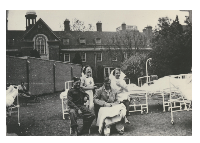
Figure 3 Patients and nurses in the grounds of St Hugh's College, Oxford.