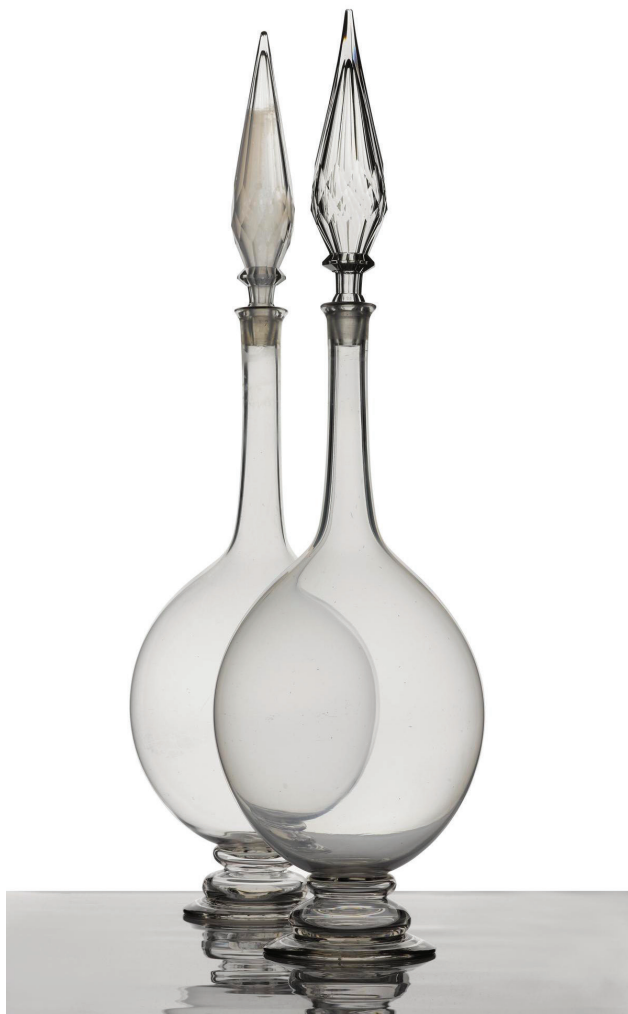
Figure 1 Image of carboys from Eric Knott's collection on display in the Natural Museum of Scotland's new galleries.

at the Dispensary was to prepare and dispense medicines prescribed by the Medical Officers, and their Assistants, and to provide help to emergency cases that arose at night. The Apothecary was to be on duty from 9am to 9pm every day, much longer hours than the Medical Officers. The Apothecary was originally allowed to take on Apprentices and Students, but no more than four at any one time. 2