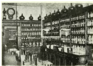
Figure 2 A corner of the Royal Public Dispensary teaching space.