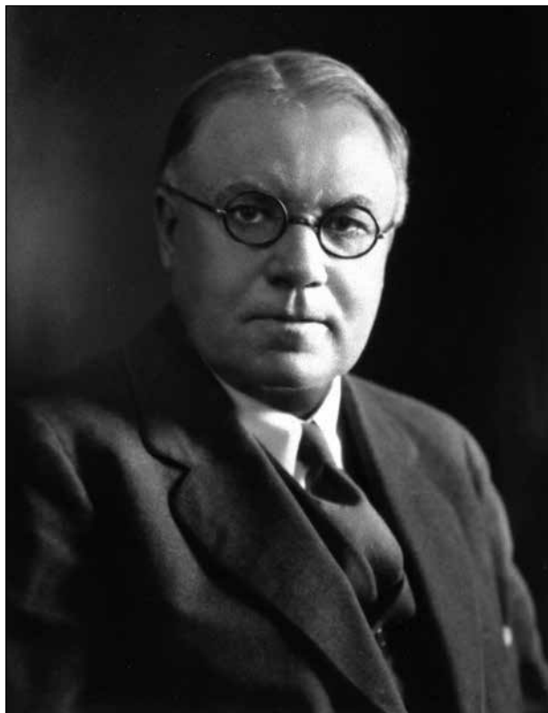
FIGURE 2 Walter Bradford Cannon

faith. He reports being challenged by the church following this decision; 'he wanted to know what right I had, as a mere youth, to set up my opinion against the opinion of great scholars'. 19