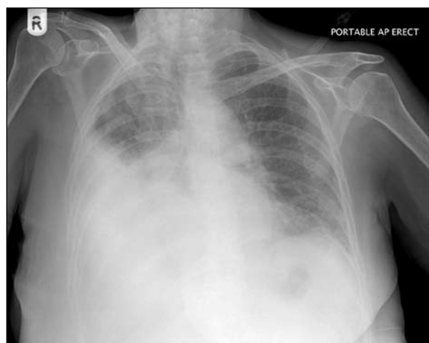
FIGURE 1 Chest radiograph suggestive of moderate right pleural effusion.

Pleural biopsy revealed the presence of metastatic mucinous adenocarcinoma. Immunohistochemistry showed it to be positive for thyroid transcription factor-1 (TTF-1) and carcinoembryonic antigen (CEA), suggesting a pulmonary origin for the malignancy. The patient was