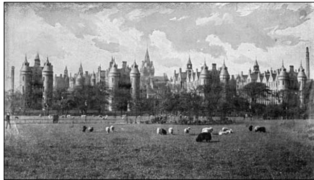
FIGURE 1 Photograph of the Royal Infirmary of Edinburgh on the 19th annual dinner menu of the Old Residents' Club, from the late 1920s.

Starting in August 1729 there have been four Royal Infirmarys in Edinburgh. The first was a house at the head of Robertson's Close, rented from the Town Council to form a four-bed hospital which in 1736, under a Royal Charter, became the first Royal Infirmary of Edinburgh. In 1741 patients were admitted to a nearby, purpose-built, second Royal Infirmary, which had 228 beds. Two surgical buildings were added in 1832 and 1853, but growth and overcrowding on the site led, in 1879, to a third Royal Infirmary being built at Lauriston Place, incorporating medical, surgical and support facilities, with a Residency as an integral part of the construction. This was the first voluntary hospital in Scotland, with a manager and hospital superintendent appointed by the Court of Contributors, an arrangement that continued until the founding of the NHS in 1948. It was designed with 555 beds, although initially only 477 beds were used, with four wards being held in reserve. 2 The infirmary was funded by charitable contributions, and with an annual average cost of £60 per bed the managers sought individuals to endow a bed to be named for them. In 1881 the first endowment came from the scholars of Merchiston Castle School, 2 and subsequently all donors were identified on boards in the main surgical corridor.