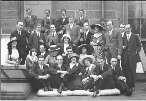
FIGURE 4 Residents with members of the D'Oyly Carte Opera Company on the roof of the Edinburgh Residency Mess, c. 1920.

Opera Company gave a concert in the surgical theatre and then repaired to the residency for tea. There is a photograph of the residents with the cast (Figure 4), in which the smiling young ladies of the Company look extremely fetching in their long dresses and large hats. The residents, crowding close to them, also seem very happy.