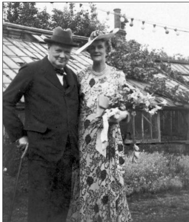
FIGURE 2 Winston and Clementine Churchill, photographed in the 1930s.

But the combination of stresses that followed his appointment – the overrunning of the Low Countries, the evacuation at Dunkirk, the fall of France, the beginnings of