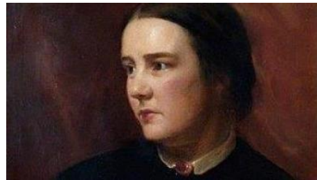
Untold LGBTQ+ Histories in Medicine and Dr Sophia Jex-Blake

"I am currently studying in the library at RCPE. This is my first time here, now having the need to escape my 2.5yr old at home. I just want to take the time to say thank you, not only for the toy boxes in the library but for the inclusivity that they show. I have a facial birthmark and as a child, I felt underrepresented and had nobody or no resources to look to so that I could feel more normal. I was absolutely thrilled to see 'Tyler's purple arm' and there is a vitiligo Barbie upstairs." Feedback from a member