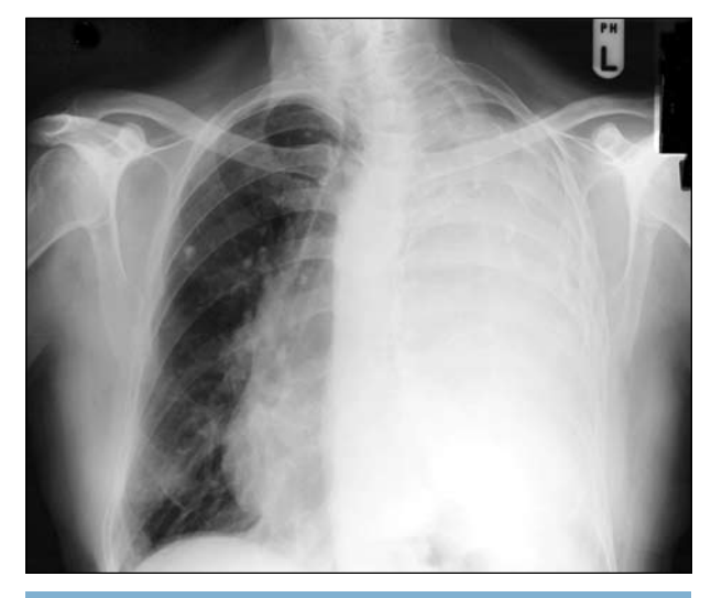
FIGURE 1 An 84-year-old male with a history of tuberculosis, treated 40 years ago with an artificial pneumothorax, presented with a four-month history of increasing dyspnoea and left-sided chest pain. His initial chest X-ray demonstrated a complete white-out of the lung with mediastinal shift and a small right upper lobe calcified granuloma consistent with his history of previous tuberculosis therapy. There was no evidence of active rib pathology to explain his chest discomfort. A diagnostic aspirate demonstrated a sterile exudative effusion, negative for inflammatory or malignant cytology.

A large left-sided pleural effusion with mediastinal shift was confirmed on chest X-ray (Figure I) and subsequent computed tomography (Figure 2). A turbid, aseptic exudative (lactate dehydrogenase [LDH] 4488 iu/L) pleural aspirate negative for cytology was initially treated with anti-tuberculous therapy, given the small chance that the patient's symptoms represented a relapse of his old TB. However, there was no evidence of an improvement. Bronchoscopy and left thoracotomy revealed a large blood-stained encysted tuberculous empyema cavity, with granulation tissue invading the adjacent intercostal spaces. This was resected and decorticated. The histopathological analysis of the surgical specimens was negative for all epithelial and mesothelial markers but consistent with an atypical non-Hodgkin's anaplastic large B-cell CD79a positive malignant lymphoma I, termed pyothorax-associated lymphoma (PAL), which unusually was CD20 negative but CD30 positive. In situ hybridisation revealed the cells to be Epstein-Barr virus nuclear antigen (EBNA)-I