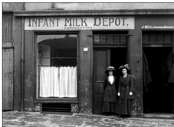
FIGURE 3 Infant Milk Depot, 106 Maitland Street, Cowcaddens, Glasgow.

Another initiative, in Glasgow and elsewhere, was the infant milk depots. Close to the Children's Dispensary was the Cowcaddens infant milk depot in Maitland Street (Figure 3). Opened in 1904, it was one of several distributing dairies served by a central depot in