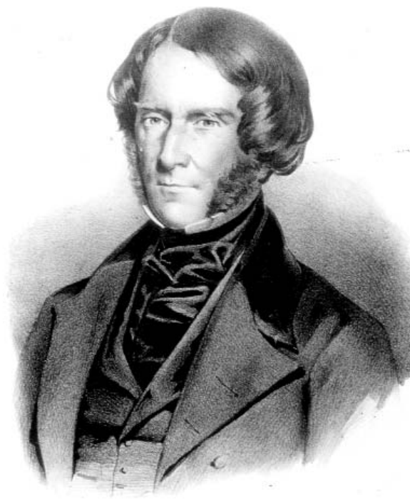
FIGURE 1 Christison as a young man in 1821.

This training determined the future course of his career, and taught him that chemical analysis of body fluids and tissues was a major route to increased understanding of disease as well as the study of poisons and poisoning. Paris was the centre of this new knowledge. 18 Christison's meticulous laboratory skills were encouraged by Robiquet, whilst Orfila was the leading figure in the new field of medical jurisprudence and the study of poisons, publishing profusely. Christison's own first paper published in 1823 with Coindet concerned experiments on oxalate poisoning. 19