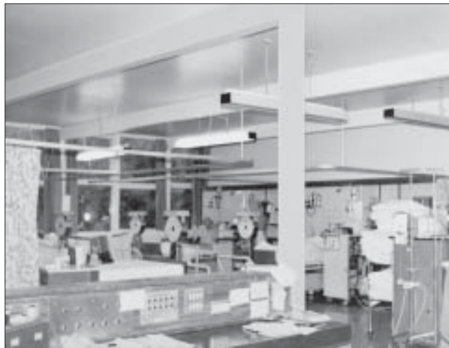
FIGURE 3B The upper floor of the MRU building with ten dialysis stations in the 1970s.

Officer went round the unit and with the nurses' assistance cannulated all the artificial a.v. fistulas. In 1972, D-machines were introduced and they were used with hollow fibre dialysers or flat plate disposable dialysers. Hollow fibre dialysers are comprised of numerous bundles of dialysis tubing contained within a plastic cylinder, and they bore a certain resemblance to the first artificial kidney produced by Abel and colleagues in 1913. Safety devices, such as venous pressure alarms to detect disconnection of lines or line blockage were introduced later; for example, air embolism detectors were introduced in 1972. Before then, patient safety depended on watching the machines. Nurses used to go round the ward at night shining torches to check for blood leakage.