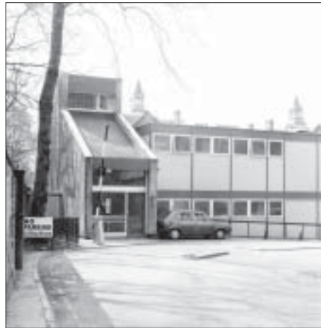
FIGURE 3A The new MRU building at the RIE in 1969.