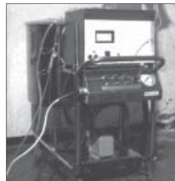
FIGURES 2 A &amp; B