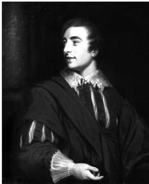
FIGURE 4 David Steuart Erskine (11th Earl of Buchan) From The University of Edinburgh Fine Art Collection. A copy by an unknown artist after Sir Joshua Reynolds.