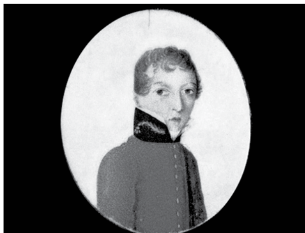
FIGURE 1 Dr James Barry (1789–1865). Painted at Plymouth c. 1813–1816. Artist unknown. Miniature on ivory.