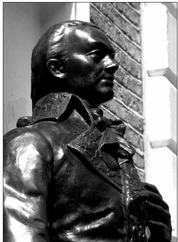
FIGURE 2 Statue of Francisco de Miranda (1750–1816), located on the western end of Grafton Way, London.

At that time women were not admitted to any medical school in Britain. It was not until 1865, the year of Dr Barry's death, that Elizabeth Garrett became the first female to qualify as a doctor in Britain. In order to fulfil Miranda's plan, it was therefore necessary for Margaret to assume the persona and dress of a young man, which she did with great success. 14 The actual date of Margaret's transformation into James Barry can be stated to within a day or so – Wednesday 29 or Thursday 30 November, 1809. 14 James and his mother arrived at Leith on the following Monday or Tuesday, 4 or 5 December 1809, just a month after the start of the Winter Session at the University. 5