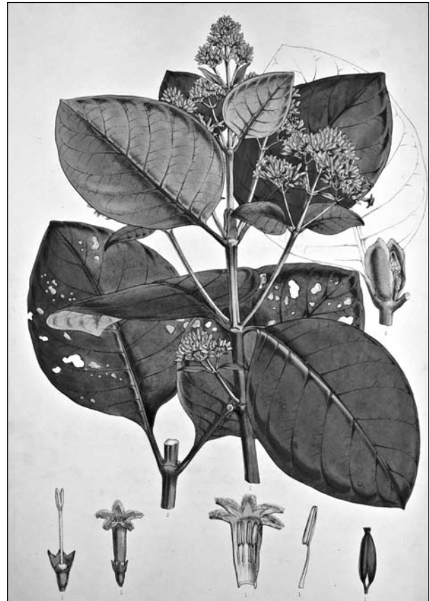
FIGURE 1 Cinchona succirubra , from the Nueva Quinolgia (1862), based on the botanical expedition of Ruiz and Pavón, 1777–88, with text by JE Howard and plates by W Fitch. (With thanks to the RCPE Library staff.)

With the colonisation of malarious parts of the world demanding large amounts of quinine, the supply from South America began to dry up. Collectors had to travel to more and more remote regions to find trees that had any bark