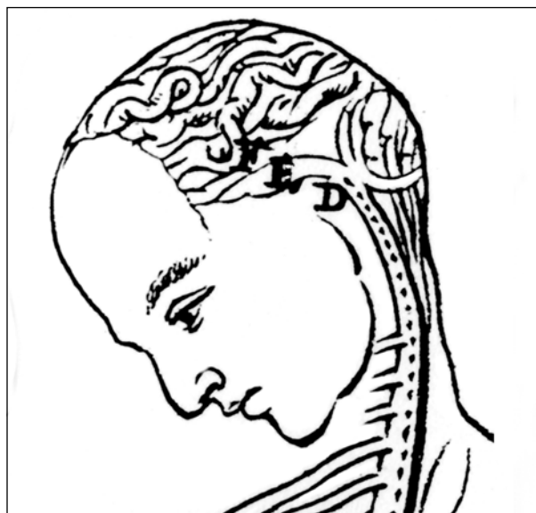
FIGURE 3 Enlargement of the head (from Figure 2), showing the supposed pores D, E, controlled by valves opened by the pull of the thread (dotted line) ascending from the periphery.

If the fire is close to the foot, the little particles of the fire which, as you know move very rapidly, are able to move with them the skin of the foot that they touch and thus, pulling the little thread c, c [the