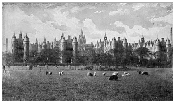
FIGURE 1 Photograph of the Royal Infirmary of Edinburgh on the 19th annual dinner menu of the Old Residents' Club, from the late 1920s.

Starting in August 1729 there have been four Royal Infirmarys in Edinburgh. The first was a house at the head of Robertson's Close, rented from the Town Council to form a four-bed hospital which in 1736, under a Royal Charter, became the first Royal Infirmary of Edinburgh. In 1741 patients were admitted to a nearby, purpose-built, second Royal Infirmary, which had 228 beds. Two surgical buildings were added in 1832 and 1853, but growth and overcrowding on the site led, in 1879, to a third Royal Infirmary being built at Lauriston Place, incorporating medical, surgical and support facilities, with a Residency as an integral part of the construction. This was the first voluntary hospital in Scotland, with a manager and hospital superintendent appointed by the Court of Contributors, an arrangement that continued until the founding of the NHS in 1948. It was designed with 555 beds, although initially only 477 beds were used, with four wards being held in reserve. 2 The infirmary was funded by charitable contributions, and with an annual average cost of £60 per bed the managers sought individuals to endow a bed to be named for them. In 1881 the first endowment came from the scholars of Merchiston Castle School, 2 and subsequently all donors were identified on boards in the main surgical corridor.