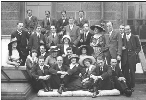
FIGURE 4 Residents with members of the D'Oyly Carte Opera Company on the roof of the Edinburgh Residency Mess, c. 1920.

Opera Company gave a concert in the surgical theatre and then repaired to the residency for tea. There is a photograph of the residents with the cast (Figure 4), in which the smiling young ladies of the Company look extremely fetching in their long dresses and large hats. The residents, crowding close to them, also seem very happy.