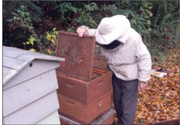
FIGURE 2 A recent picture of the patient at work in his apiary, now wearing a protective face mask. Note the absence of gloves.