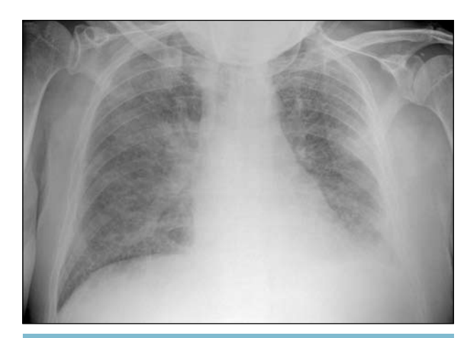
FIGURE 2 This chest X-ray shows the development in the patient of an extensive diffuse bilateral alveolar opacification just prior to death, following the development of an acute respiratory distress syndrome and renal failure. Three weeks after the stroke the patient developed a DVT in his left ileo-femoral veins, followed by a DVT in the right ileo-femoral veins three weeks later and, after a further week, a pulmonary embolism, despite aggressive anticoagulation and the insertion of an inferior vena cava filter.

FIGURE 1 Magnetic resonance imaging scans from a 53-year-old man presenting with a cerebellar stroke, whose symptoms included a horizontal and vertical nystagmus, right-sided Horner's syndrome, vertical diplopia, mild dysarthria and right-sided discoordination. The CT scan showed infarction of the right cerebellum and adjacent midbrain. Scans A and B show extensive acute right cerebellar infarction extending into the midbrain. Scan A shows the involvement of the right superior cerebellar artery, and scan B the anterior inferior cerebellar artery. Subsequent MRA of the circle of Willis and neck vessels showed right superior cerebellar involvement. There were also right supratentorial lacunar infarcts, but no stenosis of carotid or vertebral arteries.