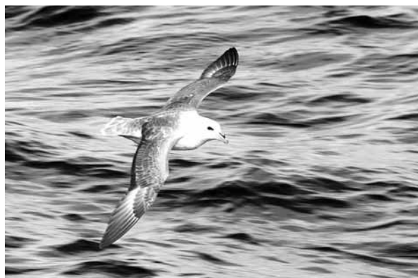
FIGURE 3 A fulmar in full flight. Fulmar oil may have been used in cord management on St Kilda.

of its infant dead'. He noted the role of three ministers in the tetanus story: Macaulay who made the first description, Mackenzie who kept the first records and Fiddes who initiated the prevention of tetanus.