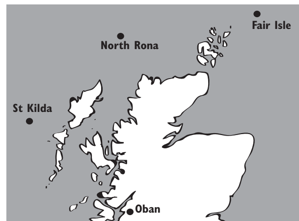
FIGURE 1 The archipelago of St Kilda, the remotest part of the British Isles, lies 41 miles (66 km) west of Benbecula in Scotland's Outer Hebrides. Today it is owned by the National Trust for Scotland and, as the most westerly point of the UK, is used for surveillance by the Ministry of Defence.

Excavations in 1995 revealed a possible burial structure dating from the Bronze Age. In 1844, an earth house (souterrain), possibly a store associated with an Iron Age house dating from about 2,000 years ago, was discovered. It consists of a long passage, with shorter passages or cells branching off. The Rev. Kenneth Macaulay 1 recorded that