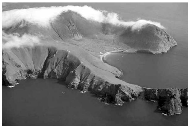
FIGURE 2 Aerial view of Hirta and Village Bay.

'In the month of Juny ane priest cumis out of y Lewis in ane bait to this Ile, and ministers the sacrament of baptism to all y bairnis that hes bene borne in the year afore.'