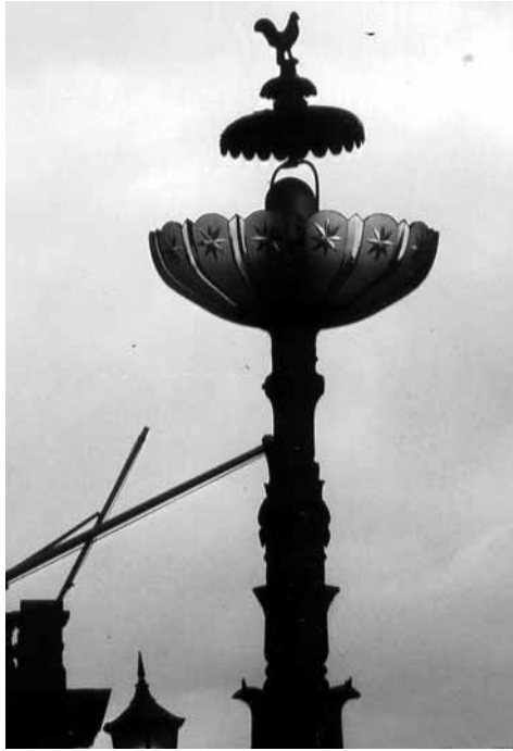
FIGURE 7 Lamp standard outside the College's main entrance crowned by a cock.