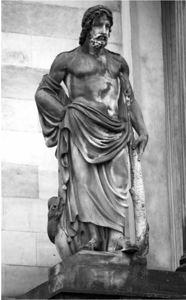
FIGURE 4 Alexander Ritchie's statue of Asklepios beside the aedicule above the main entrance of the College.

The cult of Asklepios spread from the north all over Greece in the late Archaic period (sixth century BC), then farther afield. In the second century AD, Pausanias wrote a guide to the antiquities of Greece. He mentions about 50 sanctuaries or temples of Asklepios, from Thessaly in the north-east to Messenia in the south-west. As early as the sixth century BC there were the two local variations of the birth myth, suggesting two Archaic loci of the healer cult, which perhaps reflect the migration of people. The first-century geographer Strabo states that the oldest and most famous sanctuary was at Trikka, but archaeologists have yet to find it. Messene has an important Hellenistic sanctuary, but its early roots are also still unidentified.