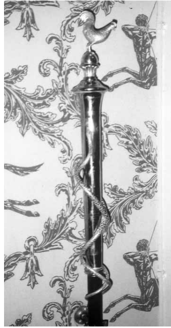
FIGURE 8 The College Officer's staff entwined by snakes and with a cock as finial. The previous centaur wallpaper is behind.