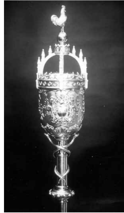
FIGURE 9 The College mace, crowned by a cock and entwined by snakes.