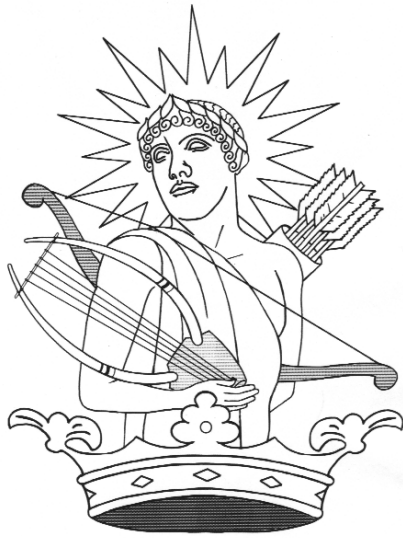
FIGURE 2 The Crest of the College's arms, drawn from the blazon in ancient Greek style.