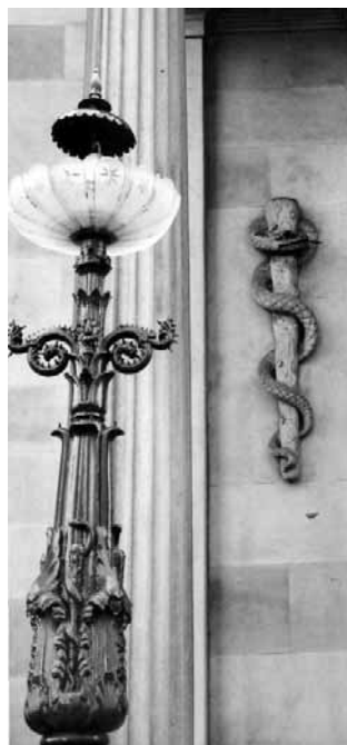
FIGURE 10 Rods of Asklepios on the base of the lamp standard and on the wall beside the main entrance.

perhaps, to have been a snake-pit below an elaborate and important building.