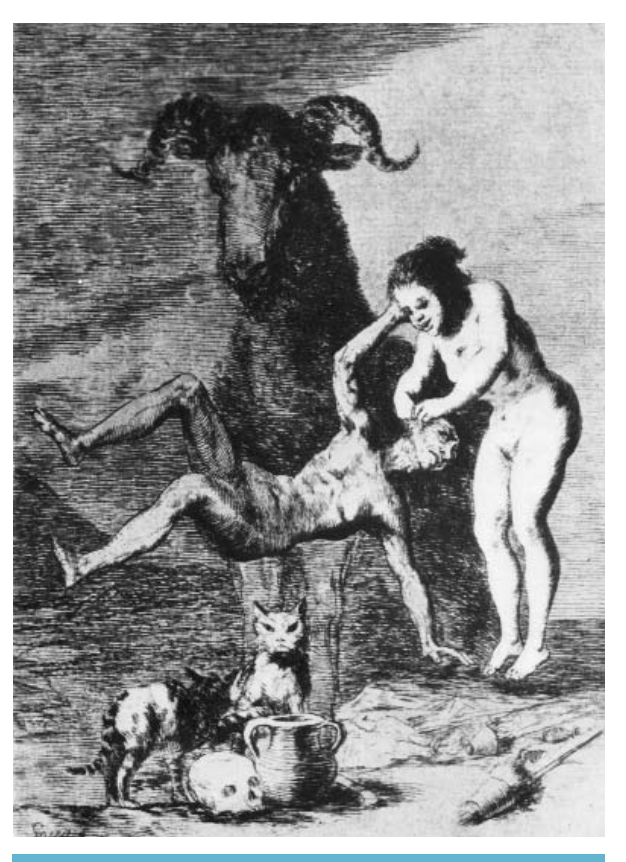
FIGURE 2 Goya's 60th Capricho. 'The Practice'. Witches rehearsing flying techniques. Note also the he-goat, the broomstick, the cats, and a skull: the traditional equipment of the 'hag'.

Flying ointment was thought to confer upon the witches the power of levitation and flight. The witch would undress, cover her skin all over with the ointment, including her anus and genitals. The broomstick would also be smeared with the mixture and introduced as deeply as possible into the vagina. The witch would then ride the stick in a kneading trough with the belief that she was having sexual intercourse with the devil in midair! The axillae were also areas which rapidly absorbed the poison. Acccording to witnesses to these orgies, the skin of the witch became red and it was believed that this hastened absorption of the salve.