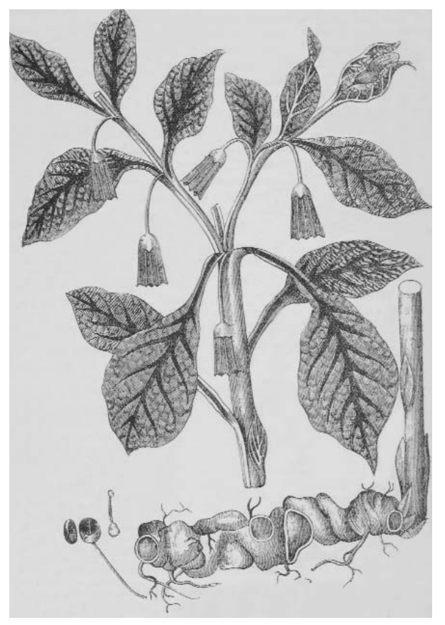
FIGURE 4 Scopolia Carniolica. From the Slovenian province of Carniola. Named after the famous botanist Scopoli who also gave his name to scopolamine (hyoscine).

It then became apparent that both hyoscine and atropine blocked the action of acetylcholine at these so called cholinergic nerve endings, and as a result they are now known as classical anticholinergic drugs. The puzzle had been solved.