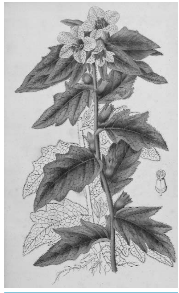
FIGURE I Hyoscyamus Niger. The Black Henbane. A good source of the alkaloid hyoscine.

incantations and magical acts such as levitation and flying. (see Figure 2).