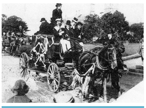
FIGURE 3 Student rag day in Sydney in 1922.