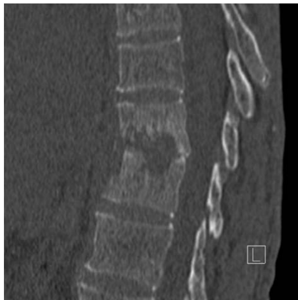
FIGURE 1 A lateral view of a spiral CT scan of the lower thoracic spine showing infective discitis at the T9/10 level with destruction of the vertebral endplates above and below.

On admission she was febrile, pale, hypertensive and the site of her internal jugular dialysis catheter was erythematous with an associated purulent discharge. She was started empirically on intravenous teicoplanin for treatment of a dialysis line site infection and the dialysis line was removed. Forty-eight hours after admission, blood cultures were found to be growing staphylococci