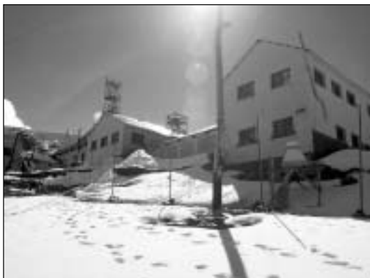
FIGURE 2 The Chacaltaya Laboratory (5,200 m).

The Chacaltaya laboratory is only a two-hour drive along an exposed dirt track from Bolivia's administrative capital, La Paz (3,650 m/12,000 ft; see Figure 2). It sits in the high Andean wilderness, in the shadow of the threatening and beautiful Huyana Potosi (6,088 m/19,974 ft). The lab itself, built in 1952 to house cosmic physics research, has plenty of room for equipment, as well as living areas and basic sleeping space for about 30 people. Each of the laboratory's